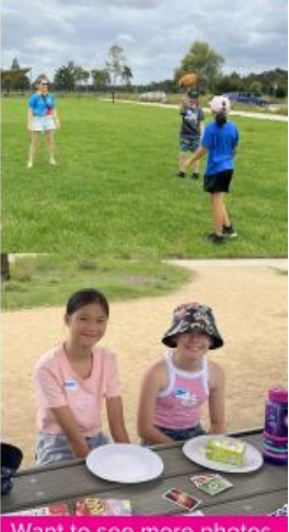
Vant to see more photos from our programs?

we nave a new Facebook page set up especially for families to see the wonderful experiences their kids are having on our Camps and Activity Days